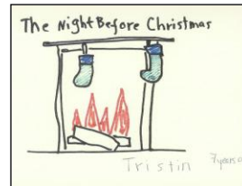
The Night Before Christmas