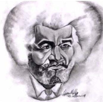
Drawing by Community House Guest