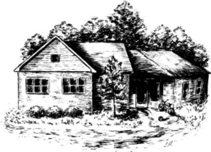
HomeStart Drawing by Former Resident

Your gift provides emergency aid, hot meals and groceries for the hungry and shelter for the homeless.